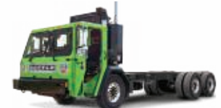
Available with CNG chassis