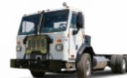
Available with conventional diesel chassis