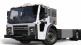
Available with electric powered chassis, with the option to integrate into the chassis to use a common battery pack