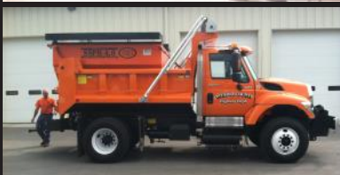
SSPH Slip In Style Asphalt Hot Boxes