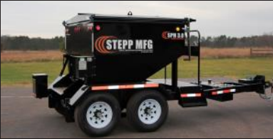
SPH Hot Boxes & Reclaimers