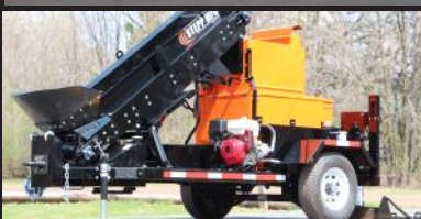
SMMT Asphalt Recyclers

Stepp Manufacturing Co., Inc. 12325 River Rd North Branch, MN 55056 651-674-4491