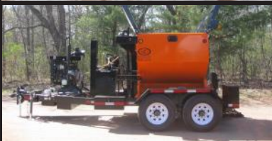
SPHOJ Oil Jacketed Auger Hot Box