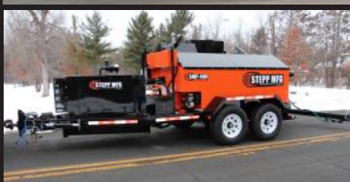
SMP Mastic Patchers