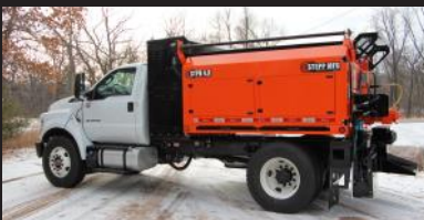
STPH Asphalt Patch Trucks