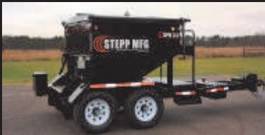
SPH Hot Boxes & Reclaimers