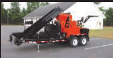
SRM Asphalt Recyclers