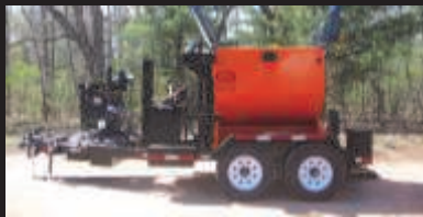
SPHOU Oil Jacketed Auger Hot Box