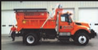
SSPH Slip In Style Asphalt Hot Boxes