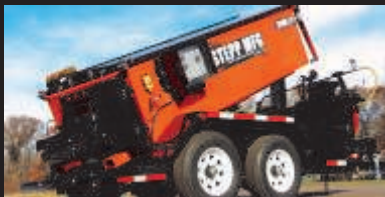
SPHD Dump Style Hot Box