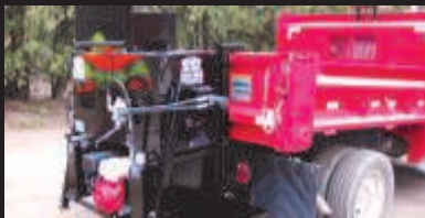
SMM Tailgate Asphalt Recyclers

Stepp Manufacturing Co., Inc. 12325 River Rd North Branch, MN 55056 651-674-4491