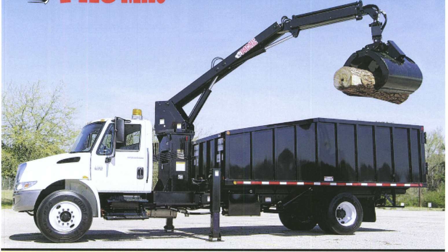
KBF 20H with TKB-1824 Body