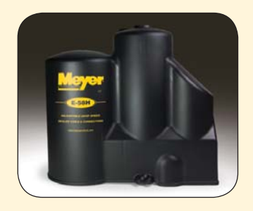
All-new custom molded hydraulic cover for E-58H units is standard. Protects from salt and road grime for improved reliability.

Behind the moldboard is totally redesigned "black iron" consisting of a robust, tubular-steel A-frame and pivot bar. This improved design has been simplified to create a stronger plow at key pressure zones and more evenly distributes the load. The pressure zones are further enhanced by three, reinforced points-of-contact and a tubular bar along the entire back for increased torsional strength. The Lot Pro also comes with easy-to-reach grease fittings in key locations like the heavy-duty king bolt.