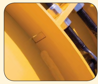
Slot and tab construction and laser cut ribs improve strength and durability. Robotically welded components make for high strength connections.