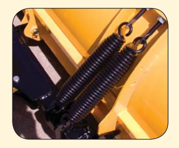
Heavy-duty trip springs last 2 to 3 times longer than the competition and are part of Meyer's ROC manufacturing process.