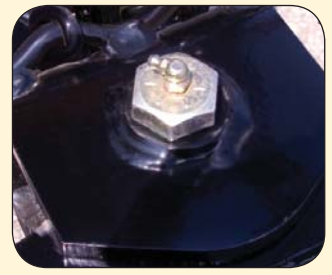
All pivot points have easy-to-reach grease fittings in key locations to increase service life.

The detailed things we do to make our plows more rugged and reliable.