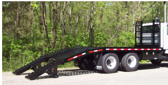
Heavy Duty Bed Floor with Ramps and Tread Gripping Angles