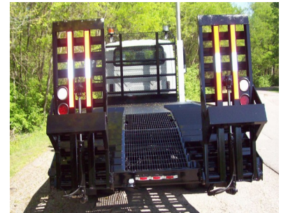
Hydraulic Dovetails with Inboard Lights