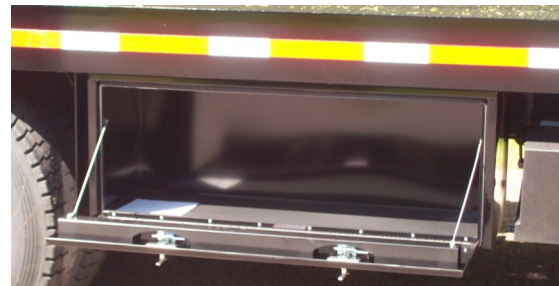
Convenient 48" Underbody Tool Boxes