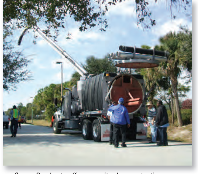
Super Products offers on-site demonstrations as a convenient, cost-effective way for customers to experience the Camel first hand.

VISIT OUR WEBSITE TO EASILY LOCATE THE DISTRIBUTOR COVERING YOUR AREA