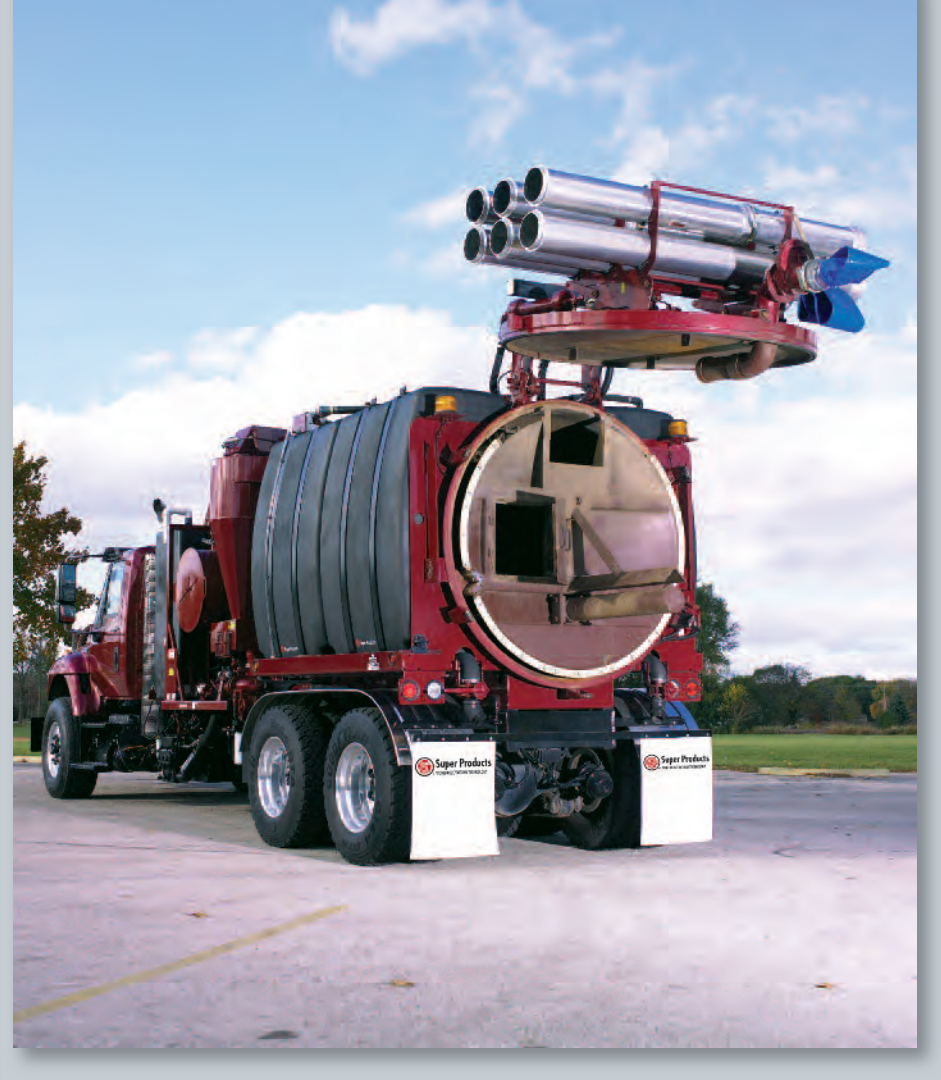
From its ejector plate unloading and dewatering system to its water recycling capability, Super Products' Camel sewer and catch basin cleaner is truly unlike any other combination unit on the market today!

Simply fill the system with fresh water and, true to its name, the environmentallyfriendly Camel allows your crews to work all day without the need to stop frequently to replenish the unit's fresh water supply.